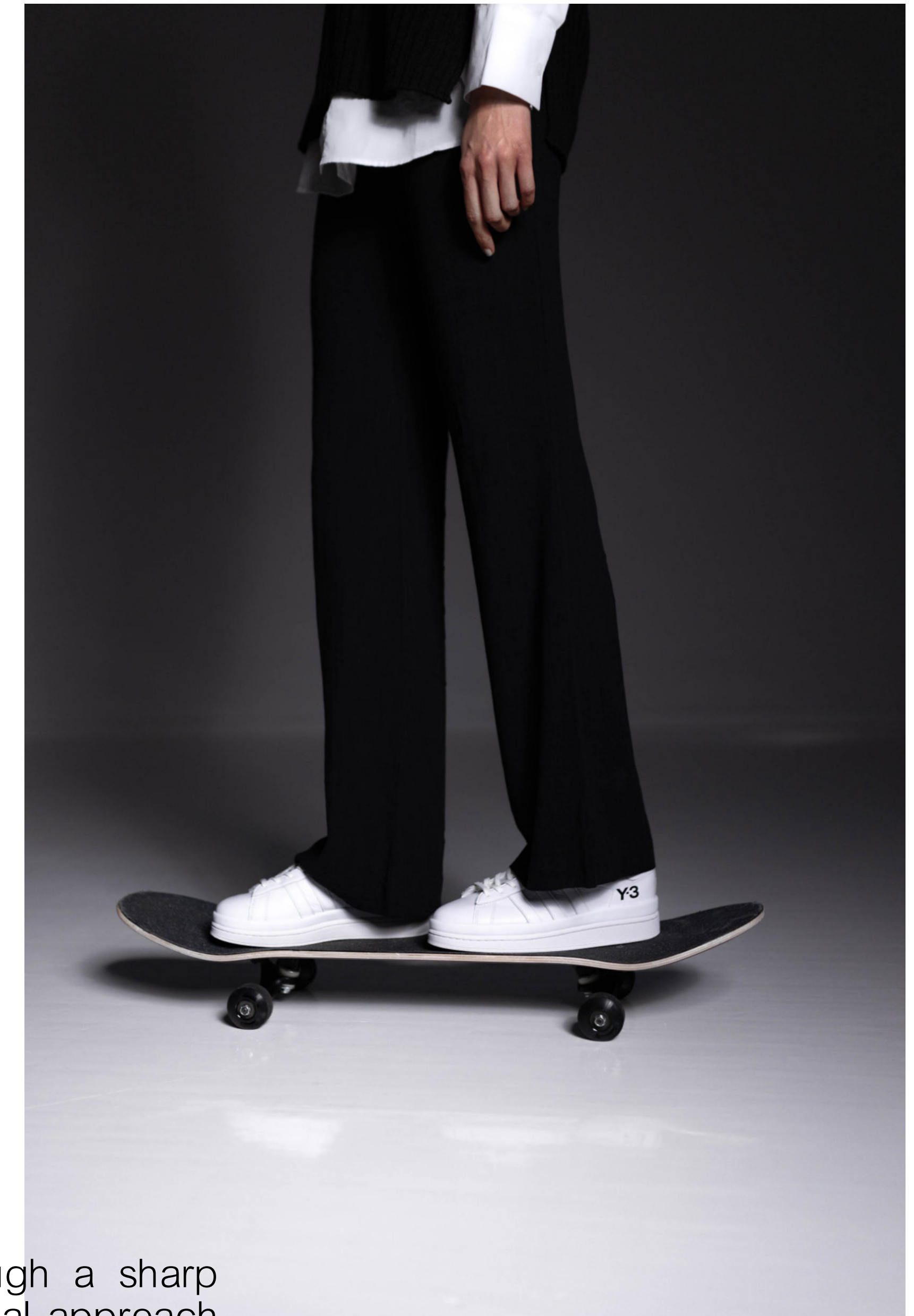
Y-3 examines sportswear through a sharp lens, informing an unconventional approach to the expected.