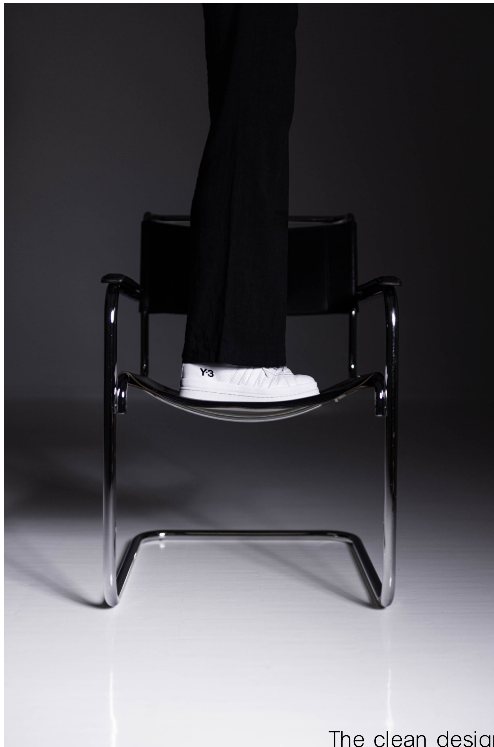
The clean design of the Hicho Shoes rides on a thick platform, adding height and creating a subtle statement.